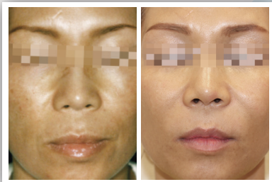
FYBBL™ | 7 Years of routine tx